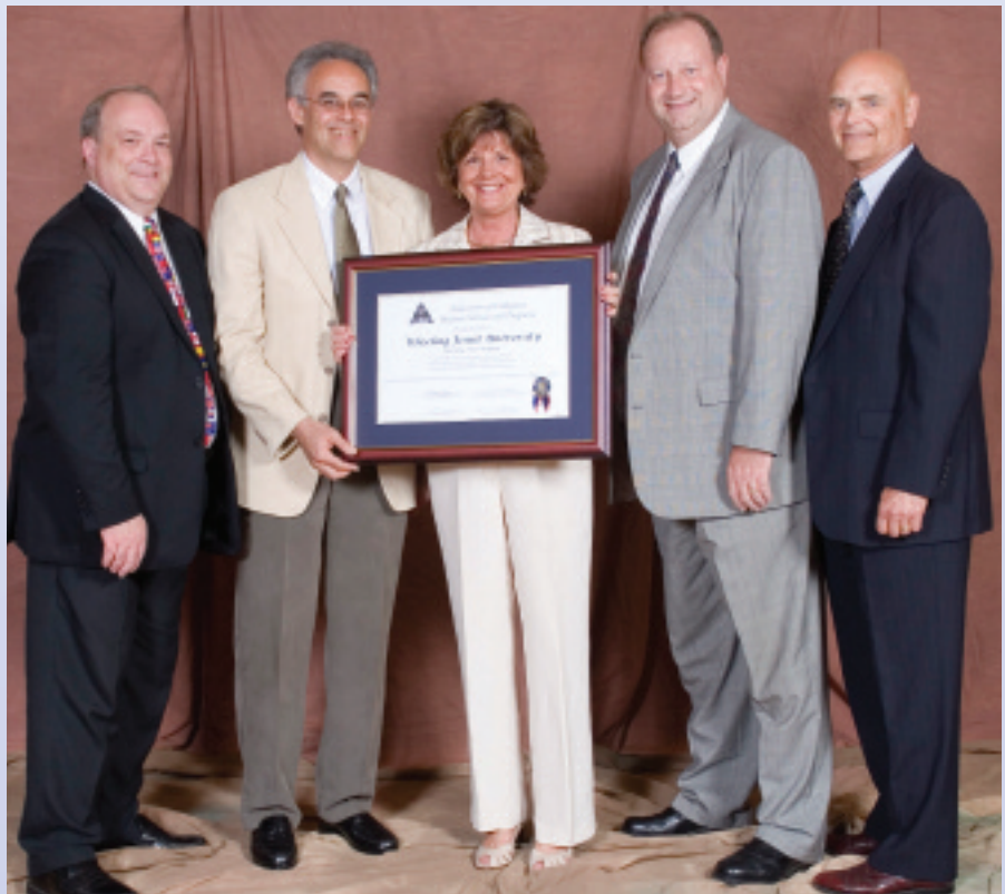
Wheeling Jesuit University was recognized at the 2007 Annual Conference in Orlando for achieving accredited status.

bodies such as AACSB, ECBE, and IACBE may be eligible for an accelerated accreditation process at a far lower cost and in a shorter timeframe to obtain the prestige and marketing advantage of being accredited by more than one accrediting body.