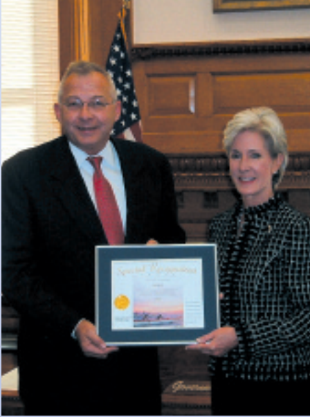
Kansas Governor Kathleen Sebelius presented an award to ACBSP on behalf of the Kansas Center for Performance Excellence in recognition of the progress in pursuit of the Kansas Quality Award.